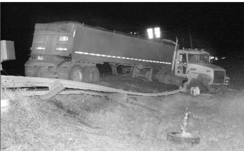
A fully-loaded coal truck rests in the ditch on State Route 67 after a violent crash Wednesday evening. Fortunately, there were no injuries.

FAIRPLAY TWP.- A Bloomfield woman is lucky to be uninjured after her pickup truck was struck