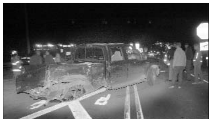
Rescue workers examine a pickup truck driven by Lori Ubelhor of Bloomfield after it was struck by a loaded coal truck at the intersection of State Routes 57 and 67. To illustrate the force of the impact, half of the pickup's rear axle - including its tire - was thrown about 100 feet after the crash (See other photo).

Responding to the wreck were the Switz City and Worthington