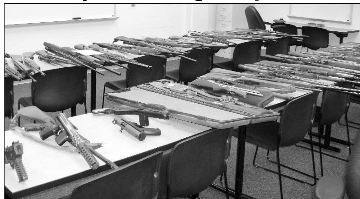
This weapons stash was found in Brown County by lawmen on Friday while investigating a report of a man being shot at. The alleged owner is still at large and wanted by area lawmen.

The weapons ranged from assault rifles to Uzi's, Tech 9's