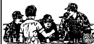
PLATE LUNCHES SANDWICHES • SOUP HOMEMADE PIE & CAKE