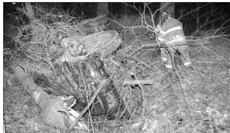
Center Township firefighters had to literally cut their way through the brush to get to a roll-over wreck with an SUV and a boat on State Route 45 Monday morning.