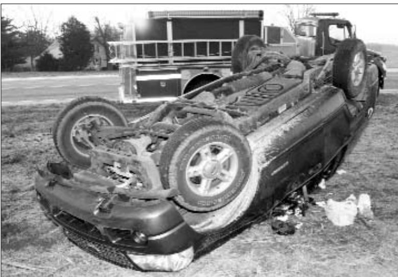
One person was injured in a roll-over wreck just south of Newberry Monday. The injured woman had to be extricated from the vehicle before being taken to Daviess County Community Hospital.

Your Independent Hometown News Team was on the scene of five of the eight wrecks.